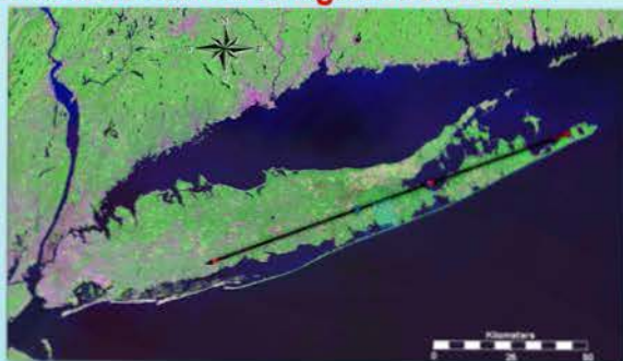
Application to Long Island, NY, including 3 inlets and 4 adjacent barrier islands